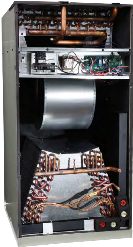
Unit shown with service panels removed. Representative drawing only. Some models may vary in appearance. Due to continuous product improvement, specifications are subject to change without notice.