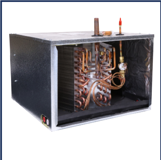
Unit shown with service panels removed. Representative image only. Some models may vary in appearance.