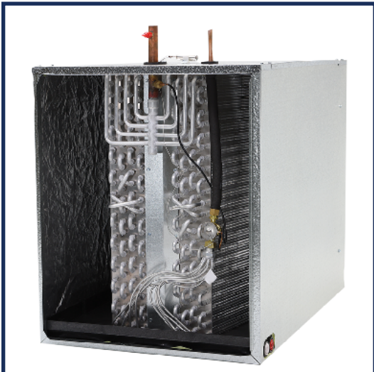
Unit shown with service panels removed. Representative image only. Some models may vary in appearance.