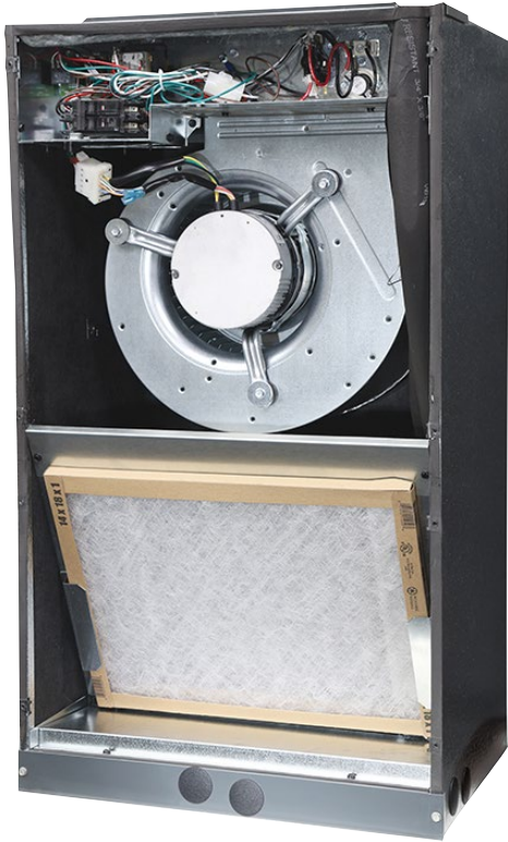
Unit shown with service panels removed. Representative drawing only. Some models may vary in appearance.